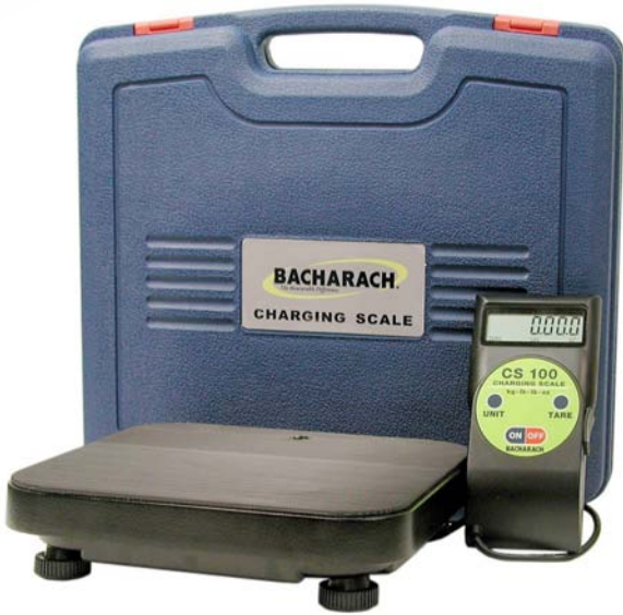
Model CS100 2010-0000