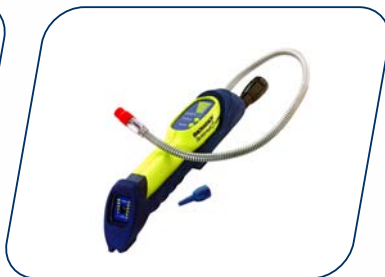
Informant 2 Dual Purpose Leak Detector