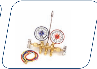
R-410A Manifold Set