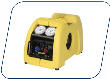
Stinger Refrigerant Recovery Unit