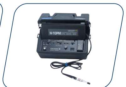
H10PM Refrigerant Leak Detector