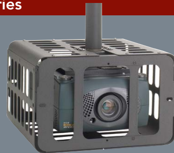
PG2A Projector Guard