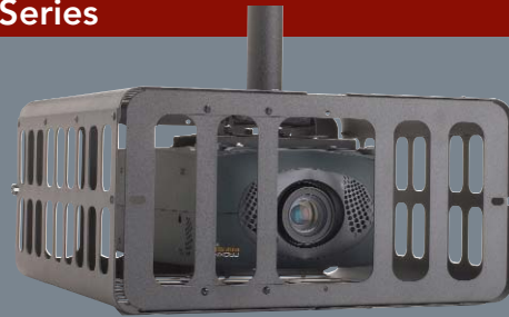
PG1A Projector Guard