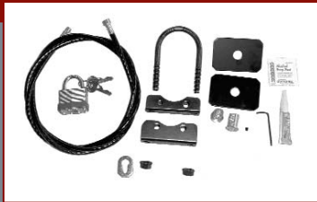
HC1 Heavy Duty Cable System