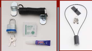
LC1 Cable Lock