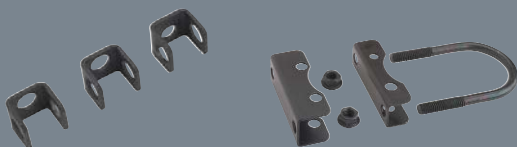
SA1 Security Anchor