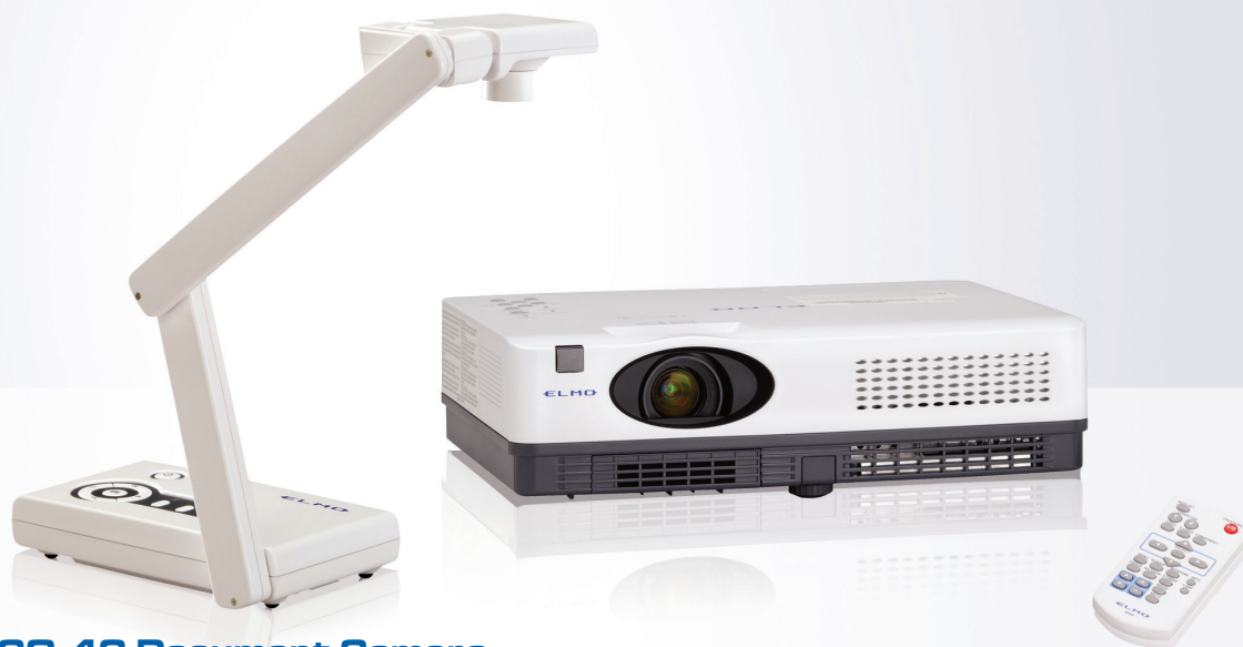
CO-10 Document Camera

Doc ument Camera & Projec Tor Bundle System THE CURE FOR YOUR CLASSROOM PRESENTATION NEEDS.