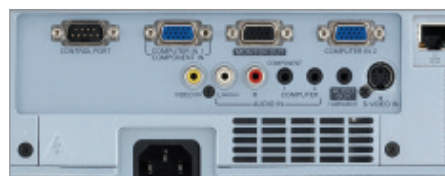
Just connect and project.