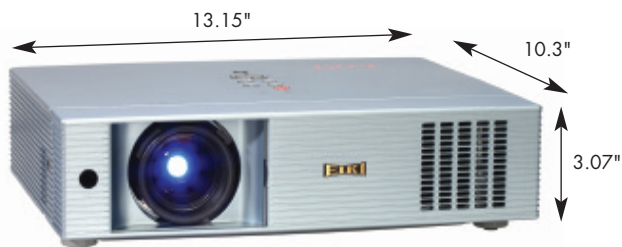
LC-XB43 - XGA • 3LCD "Brilliant" Series.

EIKI® is a registered trademark of Eiki International, Inc.