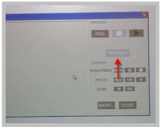
Finally tap CLOSE and you will finish your work with the image that you are working on.