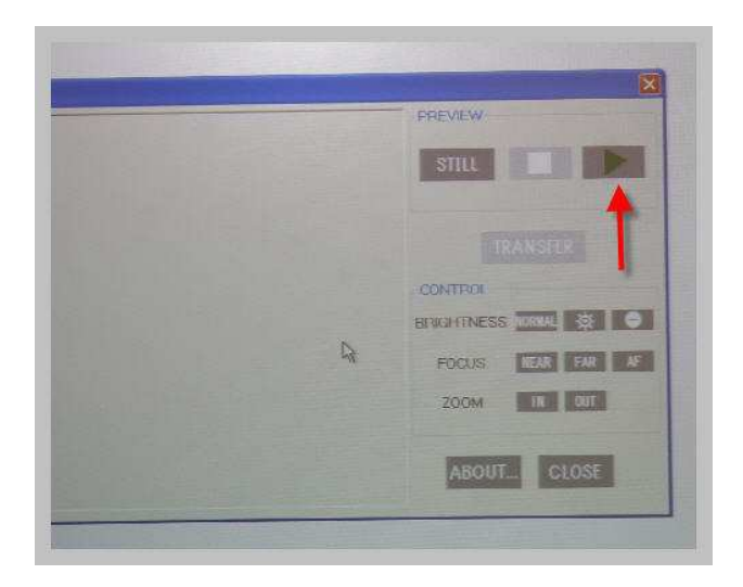
Tapping on the BOX (red arrow) will freeze the image

Tap on the GREEN ARROW (below) to bring up a live image from your ELMO document camera. You will be able to see and annotate on the image.