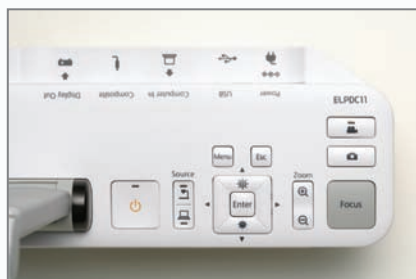
Intuitive buttons and icons