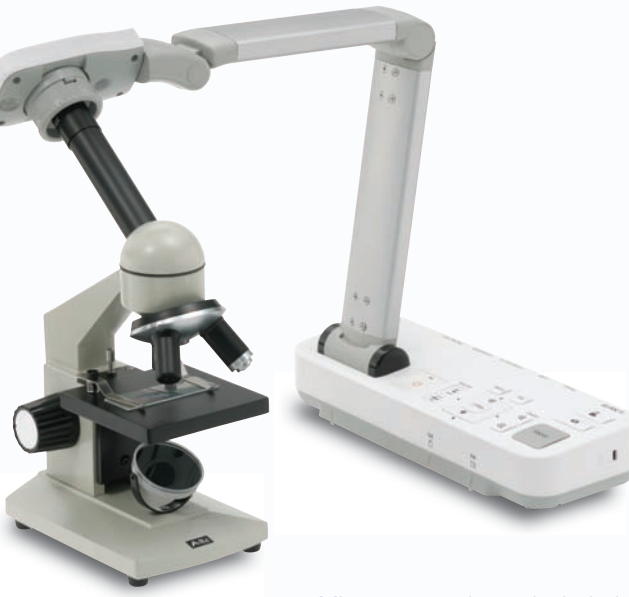
▲ Microscope adapter included (Microscope not included)