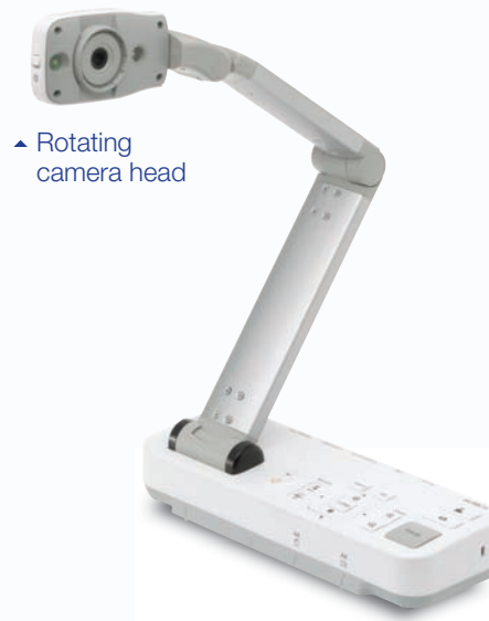
Rotating camera head