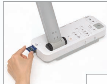
Built-in SD card slot