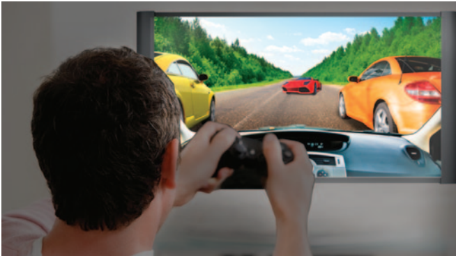
Play larger-than-life video games with vibrant color graphics. Just connect your Nintendo® Wii™, Microsoft® Xbox 360® or Sony® PS3.

Brilliant, awe-inspiring projection lets you display media from virtually any digital device with stunning clarity and color up to 12x larger than a 40-inch screen.