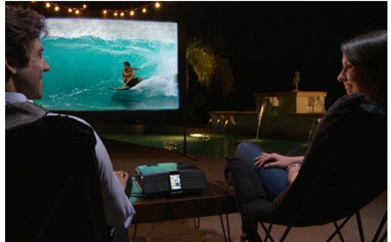
Enjoy brilliant, blockbuster movies.