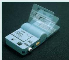
Adjustable "Flip-up" display