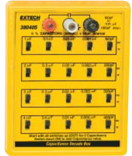
Model 380405 Capacitance Box Features: