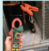
Dual Type K Inputs for taking differential temperature readings needed for superheat measurements.