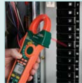
Built-in IR Thermometer for quick and safe non-contact temperature measurements. Find hot spots fast!