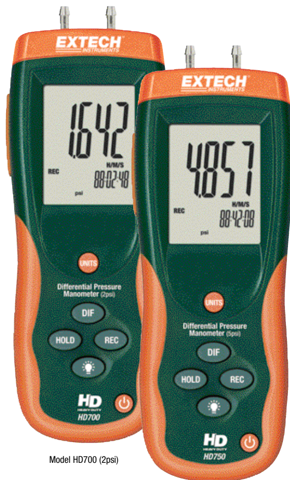
Model HD700 (2psi)