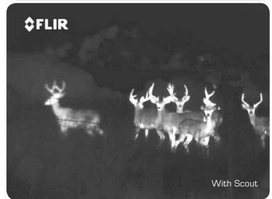
Scout PS-Series Camera Image