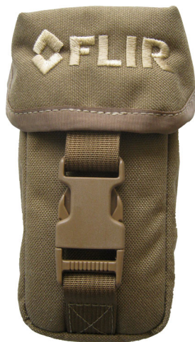
Molle-Compatible Belt Holster