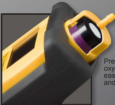
Pre-calibrated oxygen sensor easily snaps in and out

Because the oxygen sensor is field replaceable, there is no need to send the SOX3 in for time consuming calibration. The display shows when it's time for a new O 2 sensor.