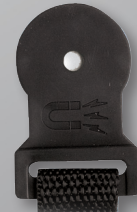
Magnetic hanger on back of SOX3 for hands free testing