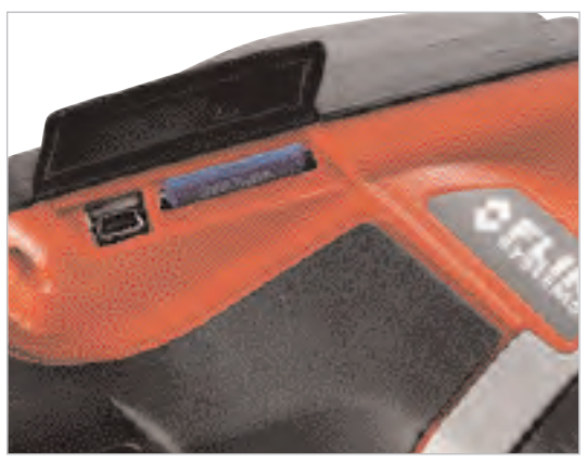
NEW! SD card that stores up to 1,000 infrared images. Move and print standard radiometric JPEG images to a computer and your printer without cables.