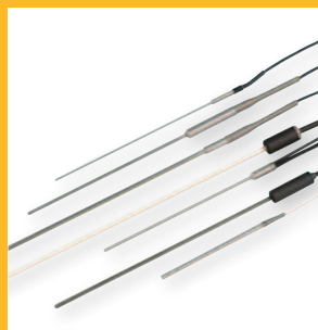
Calibrated Temperature Sensors