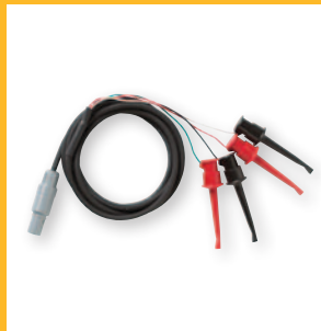
Universal RTD Adapter