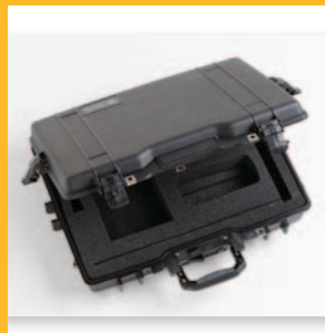
Probe and Readout Case