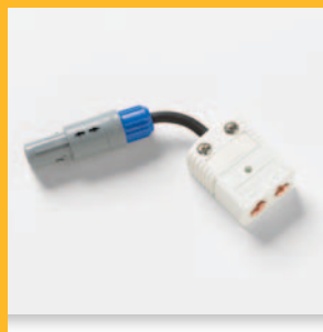
Universal Thermocouple Adapter