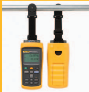
TPAK Magnetic Hanger

A wide array of accessories are available to help you maximize productivity, but the following are essential for most users.