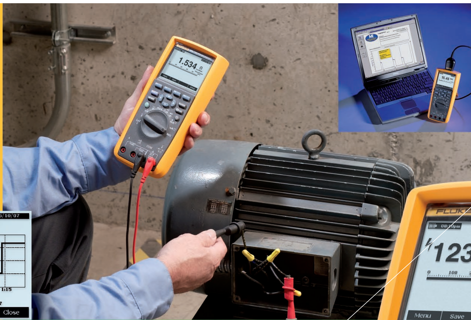
Transfer data to PC using optional cable and FlukeView Forms Software