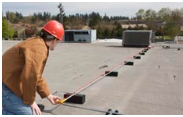
Measuring long conduit runs.