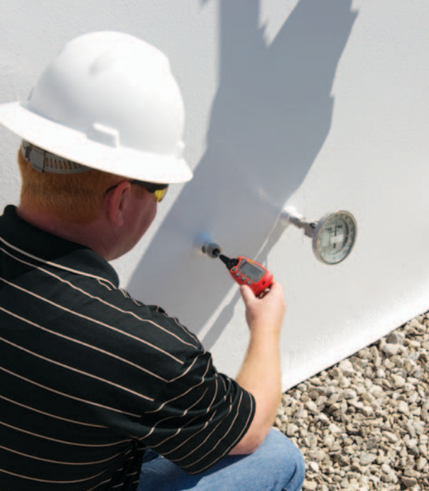
Primary standard level temperature measurements require much deeper immersion depths.