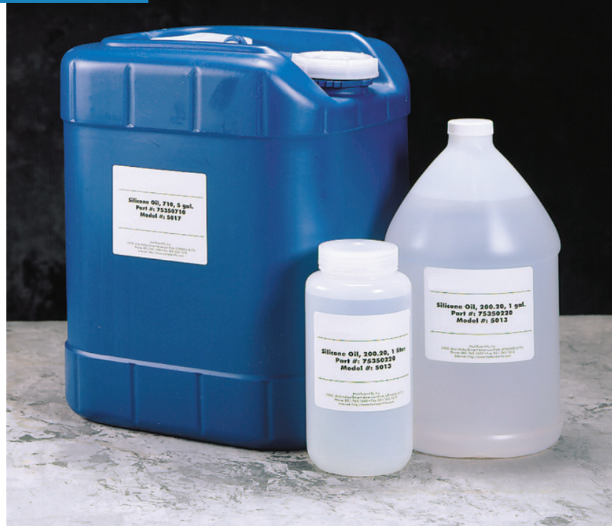
Fluke Calibration offers a wide variety of bath fluids in different container sizes.

Viscosity is a measure of a fluid's resistance to flow—we often think of it simply as "thickness." Kinematic viscosity is the ratio of absolute viscosity to density and is measured in "stokes" (at a specific temperature), which are commonly divided by 100 to give us more helpful "centistokes." The higher the number of centistokes, the more viscous (or thick) a fluid is. Viscosity is always stated at a specific temperature (often at 25 °C) and increases as the fluid's temperature decreases (and vice versa).