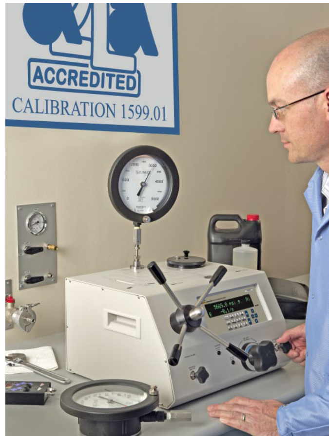
E-DWT-H's fine adjustment valve enables the operator to set pressure to the exact nominal value on the gauge under test.

To calibrate an analog gauge, the calibration laboratory requires hardware to generate, control, and measure hydraulic pressure. The deadweight tester conveniently provides all three of these functions in one integrated instrument. (see Figure 2).