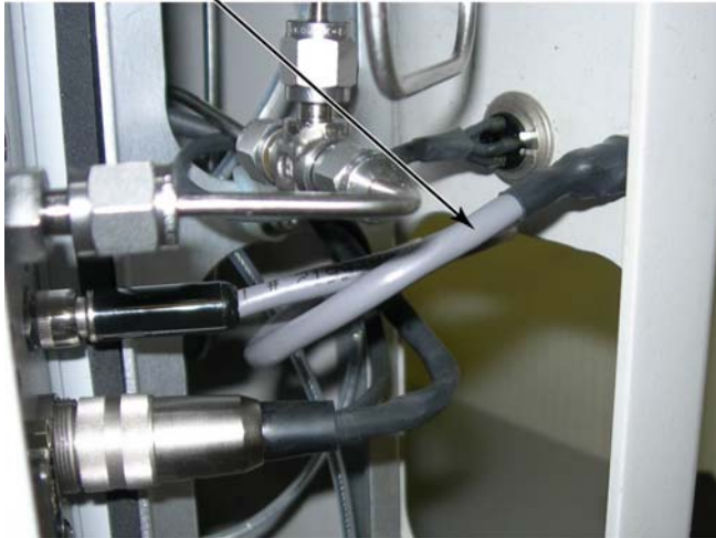
Figure 4: E-DWT internal view detail: 12V grey power cable