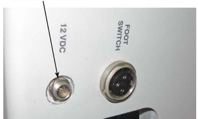
Figure 3: E-DWT rear view detail: power supply connection