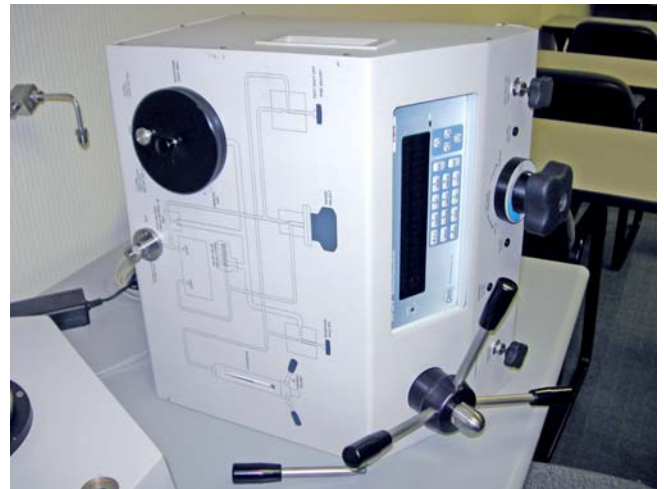
Figure 2: E-DWT on its side with one handle removed