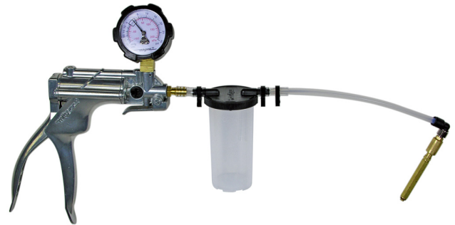
Figure 1: E-DWT-H Fill Kit, Assembled