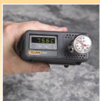
Table 2. Temperature sources