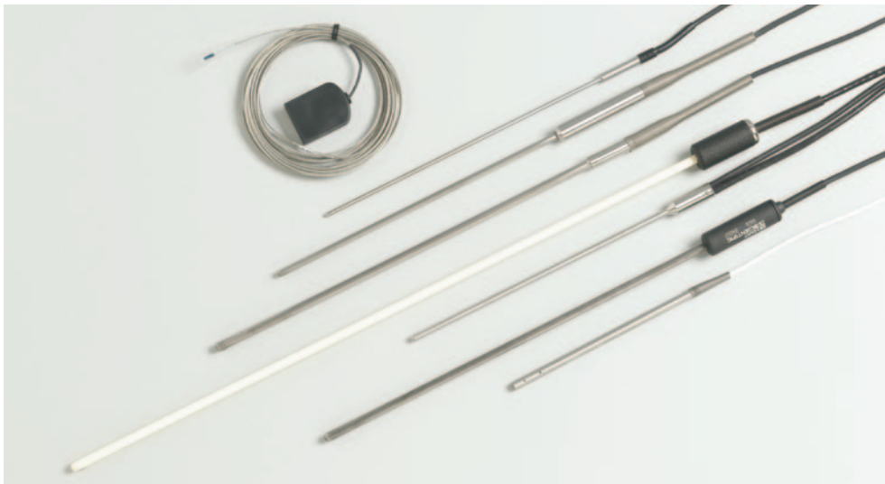
Caption to go here