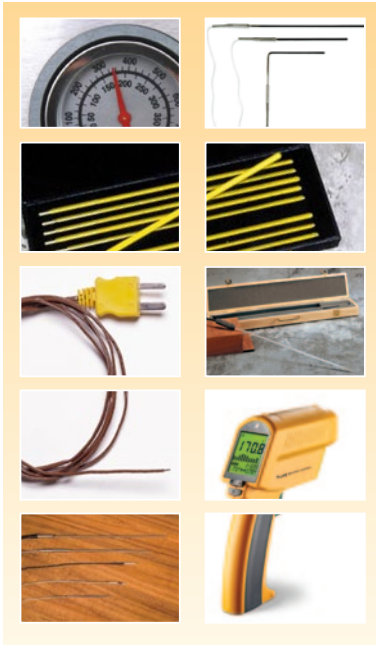
Table 1. Common thermometers that need to be calibrated