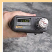
Table 2. Temperature sources