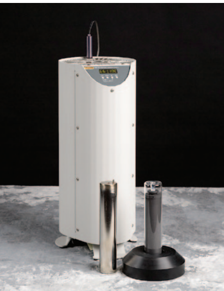
Table 5. ITS-90 fixed point calibration equipment