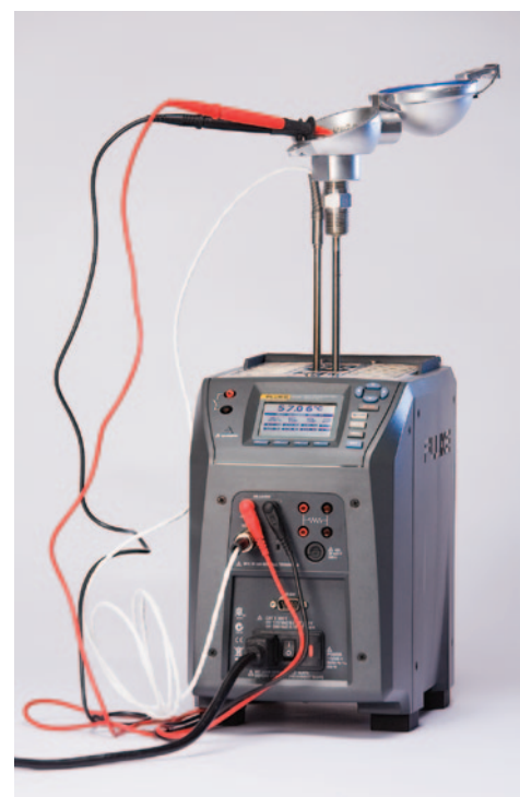
The 914X-P can act as the indicator for transmitters, thermocouples and RTDs and even a reference PRT to improve accuracy.