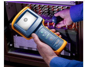
End-face inspection, using either a handheld optical or video microscope (shown here), should be done both during and after termination to check for contaminated or improperly polished connector end-faces.

Because cleaning has been part of fiber maintenance for years, most people have their own approaches for cleaning end-faces. However, beware of bad habits as many have developed in the industry over time. With an evolving base of knowledge, the industry has moved recently towards new best practices. One common approach to cleaning end-faces is to blast them with canned air, either on a connector or inside a port. Canned air is only effective on one type of contaminant: large dust particles. Canned air is ineffective not only on oils and residues but also on smaller, charged dust particles. Moreover, canned air will tend to blow large particles around inside ports rather than carefully remove them.