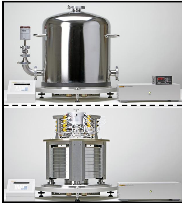
Figure 1, the Fluke Calibration PG9607

less than 1 \times 10^{-6} uncertainty. The resulting product is now sold as the Fluke Calibration PG9607 shown in Figure 1.