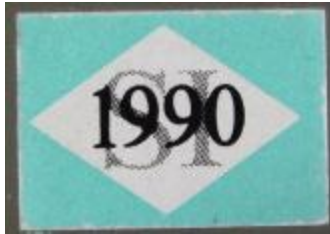
Figure 4, SI 1990 Logo Developed by NCSL

Organizations identified as Traceability Users would have to coordinate closely with Traceability Providers. If there was an effective date of the redefinition, for example, January 1, 2015, it may be possible for Traceability Users to submit their reference standards for calibration shortly before the effective date, with a request to perform a calibration to the redefinition. It would be important for the Traceability Provider to provide a report of calibration that clearly indicates that the calibration was performed to the redefinition. For the change to the U.S. volt and ohm in 1990, a “SI 1990” logo was developed by the NCSL that was used on calibration reports and on a sticker that was affixed to devices calibrated to the new definition. While it may not be practical to use a sticker for most reference standards affected by the upcoming redefinition, the development of a new logo for use on calibration reports may be an effective way to communicate the change.