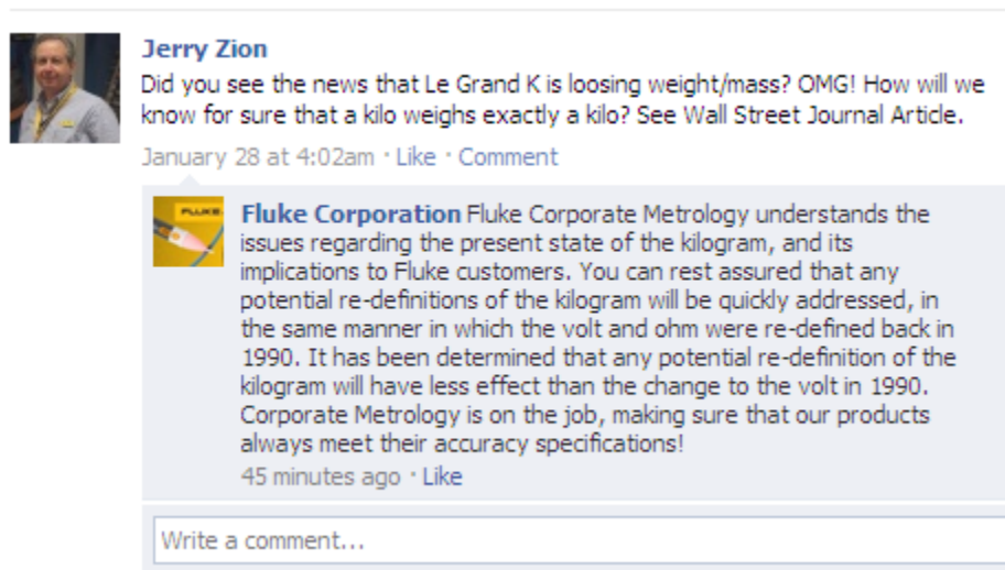
Figure 3, Example of Communication Through Social Media

there is interest in this subject by our followers. When the SI is redefined, it would be important to have communications developed that explain the changes in a manner that could be relatively easily understood. For now, it is important to communicate that we are aware of the issue and that we will be ready to share the information when the redefinitions occur.