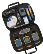
Both multimode and singlemode sources are available in the FTK1450 Complete Verification Kit