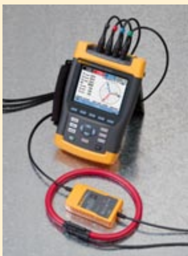
i3000s Flex connected to a Fluke 434 Power Quality Analyzer (The i430 FLEX-4PK can be used with the Fluke 434 and 435, without the need for the control box).

Note: Power supply units only available for Europe and the United Kingdom.