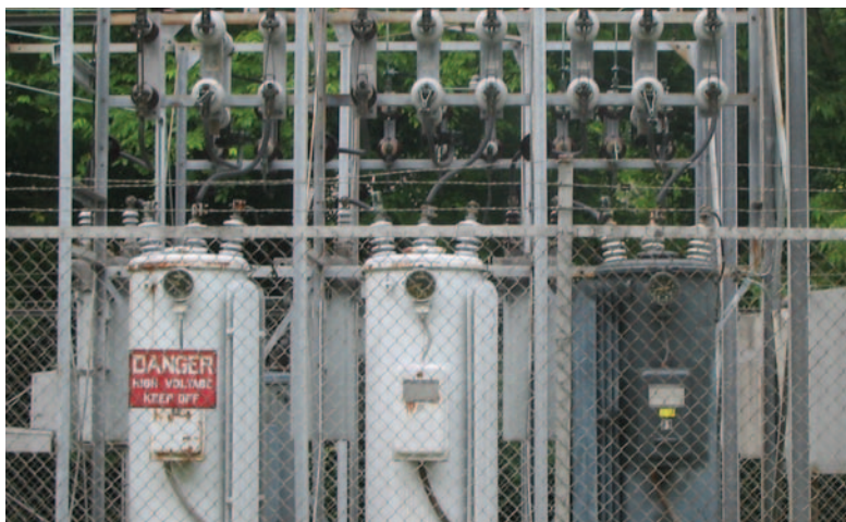
Examine transformers, comparing similar connections under similar loads.

However, if the metal surface of a motor casing is shiny, it looks like a mirror in the infrared region. Instead of seeing the temperature of the motor, the infrared camera “sees” a combination of some of the heat of the motor and some of the heat of objects around the motor. To compensate, thermographers paint a black spot on the surface or use a contact temperature probe to allow them to adjust the emissivity until the infrared reading matches the contact probe.