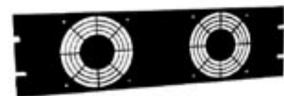
19" Grill Panel Shown