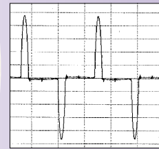
Current waveform of the inverter (primary side)