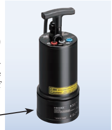
When using the SM9002