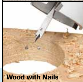
Wood with Nails