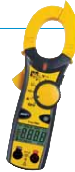
▶ 61-746 features: