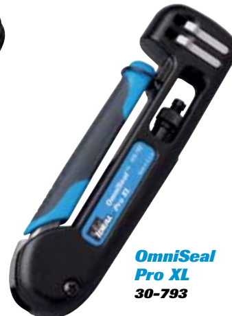
OmniSeal Pro XL 30-793