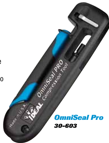
OmniSeal Pro 30-603

The IDEAL OmniSeal™ compression tools offer new additional features and increased connector compatibility in a smaller, more compact tool design to meet the demands of the professional installer. OmniSeal requires no calibration or accessory attachment to terminate IDEAL branded connectors. Most other manufacturers' compression connectors can be terminated with an easy plunger depth adjustment. The simple intuitive design combined with its size and universal connector acceptance makes this the only compression tool needed by professional installers.