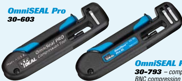
OmniSEAL Pro XL 30-793 – compresses BNC compression connectors