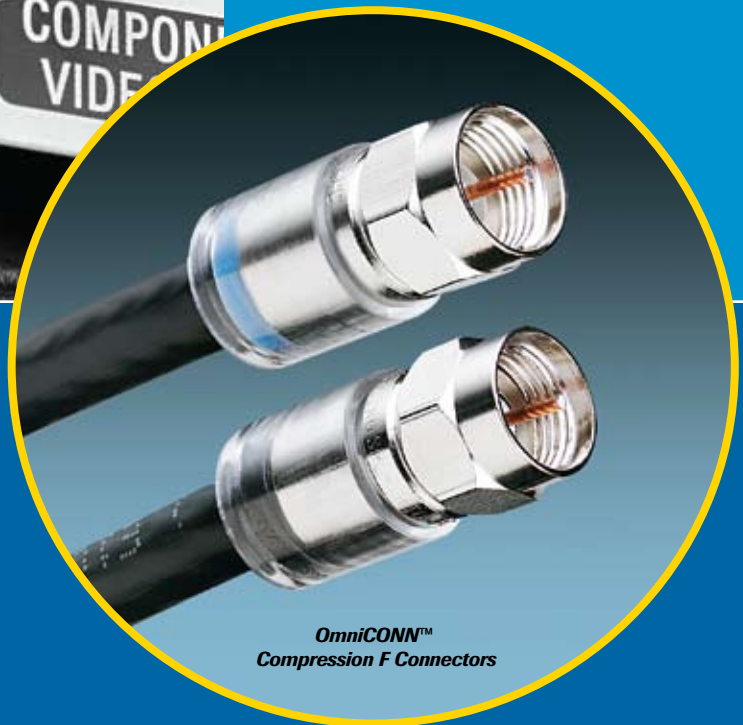
OmniCONN™ Compression F Connectors