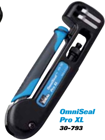
OmniSeal Pro XL 30-793