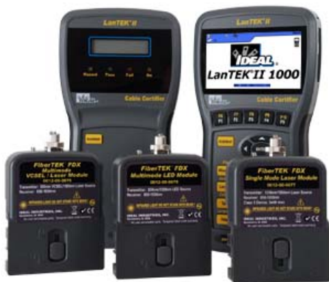
Figure 4: LanTEK® II with FiberTEK® FDX

The IDEAL FiberTEK® FDX Multimode LED (Cat# 33-990-FA01) does comply with the IEC 14763-3 launch conditions and therefore can be used to test any type of MM fiber. The Multimode Laser version (Cat# 33-990-FA02) does not comply with the requirements but can be used to test at the operator's discretion. So why use the laser source at all?