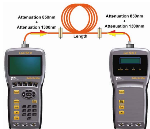
Figure 5: FiberTEK® FDX bi-directional testing without mandrels

Unique in the industry is the capability of the LanTEK® II with FiberTEK® FDX to test a single fiber in both directions at two wavelengths. This eliminates the need to swap fibers and handsets, resulting in testing times that cannot be beat.