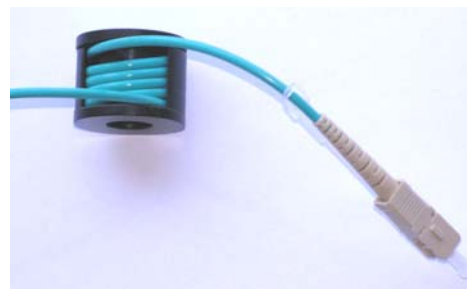
Figure 3: Fiber optic mandrel wrap

Today, manufacturers of optical fiber are introducing higher grades of multimode fiber to support very high bandwidth and generically these fibers are referred to as laser optimized . The purpose of these fibers is to support very high bandwidth signaling compared to early generation multimode fibers. These new fibers are categorized as OM3 and OM4, providing up to 4.7GHz*km of modal bandwidth. The term laser optimized leads installers to believe that they must use a laser light source to test this type of fiber. Not so. To get the best indication of actual system loss the preferred method was to use an LED source with mandrels for field testing. A mandrel is a small diameter (about 3/4") spool that acts as a "choke" to limit the filling of the fiber from an LED source.