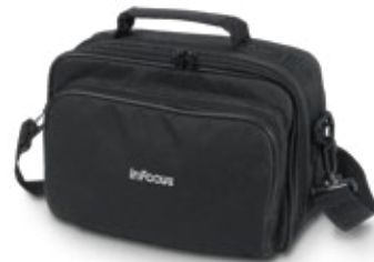
Padded carrying case is included

Plus, the IN1100 Series' durability is backed by our exclusive 5-year limited warranty, so you know it's tough and ready to perform on the road.