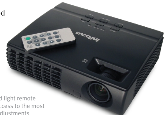
Ultra -thin and light remote provides quick access to the most common adjustments

Plus, you can quickly adjust the keystone to get a square-cornered and true image via the keystone buttons on the remote or the Quick Menu button on top of the projector.