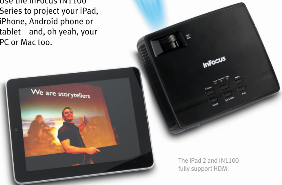
The iPad 2 and IN1100 fully support HDMI

Use the InFocus IN1100 Series to project your iPad, iPhone, Android phone or tablet – and, oh yeah, your PC or Mac too.