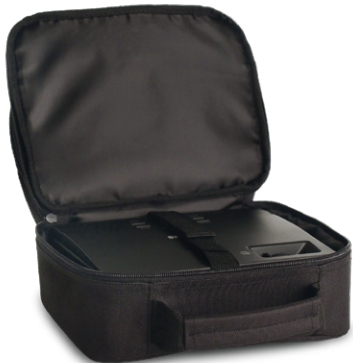
Padded, rugged carrying case is included

Room lighting can be a wildcard for the business traveler. You never know what you'll get. Pound-for-pound these powerful little projectors pump out the most lumens of most any projector out there. So you know your presentation will be brightly displayed regardless of the room's ambient light.