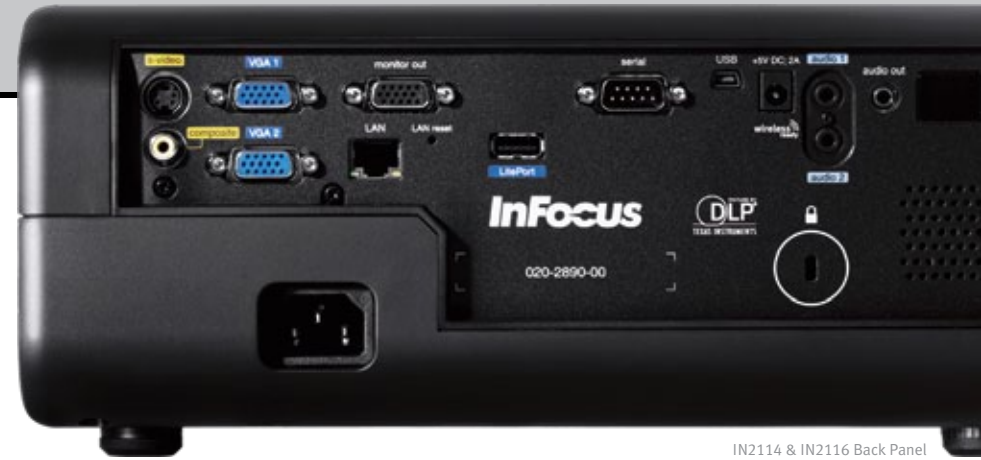
IN2114 & IN2116 Back Panel