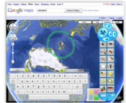
WizTech InFocus Edition software