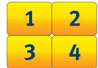
Project up to 4 computer screens at the same time