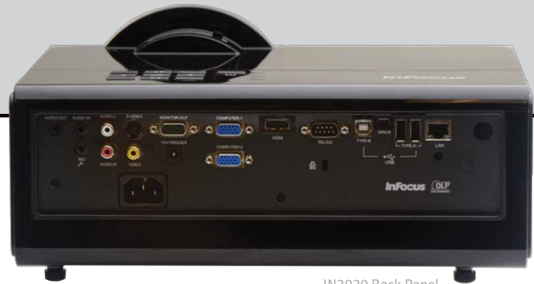
IN3920 Back Panel