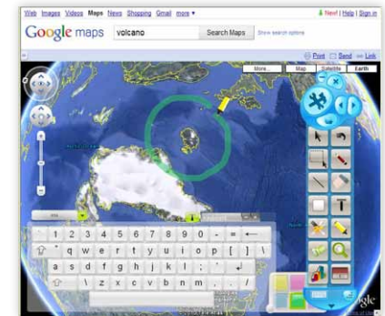
WizTech InFocus Edition software