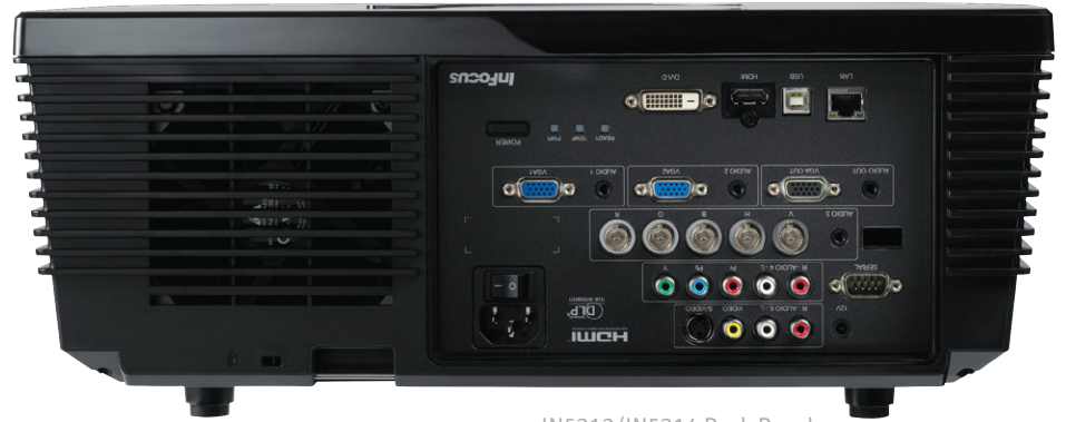
IN5312/IN5314 Back Panel

The 4000 lumens of the IN5314, IN5316HD and IN5318 display crisp, detailed images even in bright rooms. But if even more brightness is needed, you can bump it up to 4500 lumens with the IN5312. Plus, their single-lamp design makes it economical and easy to maintain.