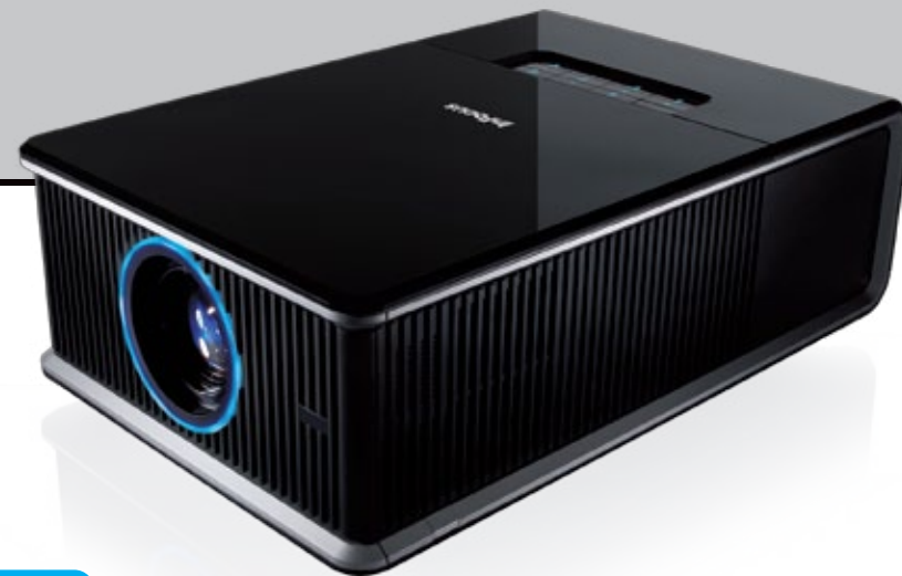
Optional Skin: Gloss Black

The IN5500 series delivers a stunning combination of HD resolution and vivid detail in true-to-life colors with a 6-segment color wheel, the latest DLP® DarkChip™3 technology and the InFocus BrilliantColor implementation.