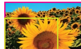
WXGA 1,280 x 800 PIXELS

With WXGA (1280 × 800) and WUXGA (1920 × 1200) native resolutions, the IN5500 series offers substantially wider space to display high resolution images for the next generation of operating systems and full high definition 1080p video.