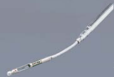
Telescopic, articulating probe