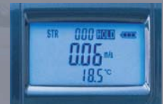
LCD display with bright backlight