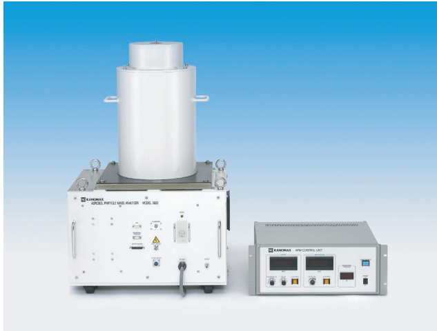
APM-3600 Analyzer and Control Unit

This unique analyzer classifies aerosol particles by mass using a true “first-principle” measurement technique.