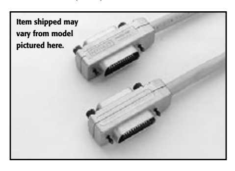
Model 7007-*: Double-shielded premium GPIB cable. Each end is terminated with a feed through style metal housing for longest life and best performance. The mating thumb screws are metric.

7007-05 0.5m (1.6 ft) 7007-1 1m (3.3 ft) 7007-2 2m (6.6 ft) 7007-4 4m (13.1 ft)