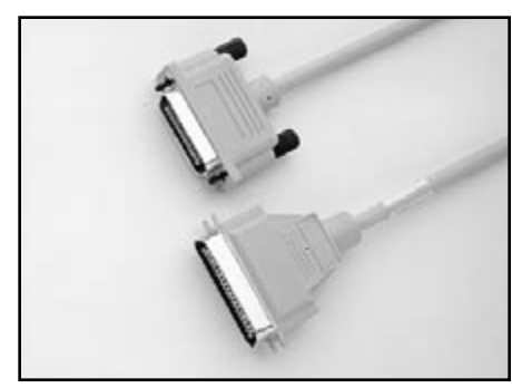
Model 8530 Centronics Adapter: IEEE-488 to Centronics cable adapter. Connects to Model 2001/2002 IEEE-488 port and any Centronics compatible printer for direct data output. Cable Length: 2m (6.6 ft).