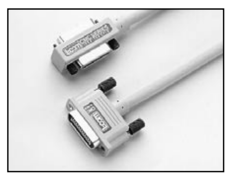
Model 7006-*: Single-shielded GPIB cable terminated with one feed through style and one straight on IEEE-488 connector. The mating thumb screws are metric.