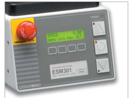
^ Digital controller contains a backlit LCD screen with menu choices for ease of setup and operation