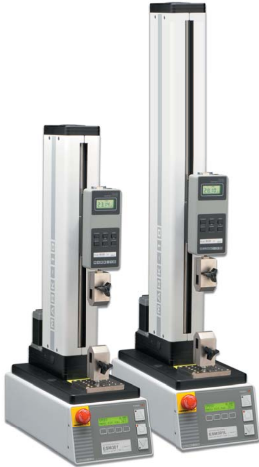
^ The ESM301 and ESM301L are shown in typical configurations with Series BG digital force gauges and G1008 film & paper grips

The ESM301 and the new ESM301L are highly configurable motorized test stands for tension and compression testing applications up to 300 lb (1.5 kN). The stands can be controlled from the front panel or via computer. The ESM301/ESM301L is engineered on a unique modular platform, allowing for “build-your-own” configurability. Features can be ordered individually at time of order or activated in the field. Integrated travel indication, overload protection, and a host of programmable parameters makes the ESM301/ESM301L quite sophisticated, while its intuitive menu structure allows for quick, simple setup and operation. A password can be programmed to prevent unauthorized changes. With a rugged and modular design, the test stand is a compelling solution for applications in laboratory and production environments.