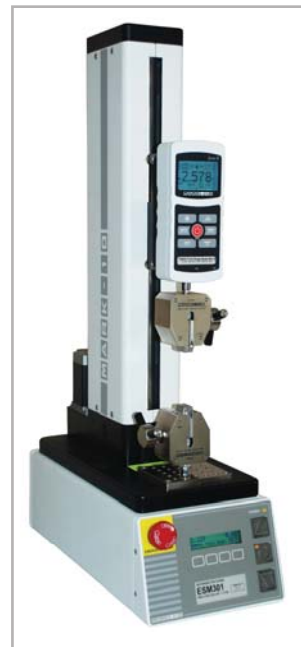
Shown with an ESM301 test stand and G1061 wedge grips

The Series 5's averaging mode addresses the need to record the average force over time, useful in applications such as peel testing, while external trigger mode makes switch activation testing simple and accurate. An ergonomic, reversible aluminum design allows for hand held use or test stand mounting for more sophisticated testing requirements. Series 5 force gauges are directly compatible with Mark-10 test stands, grips, and software.